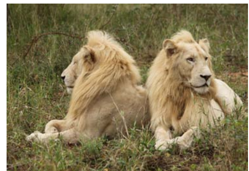
White Lions of the Royal Pride