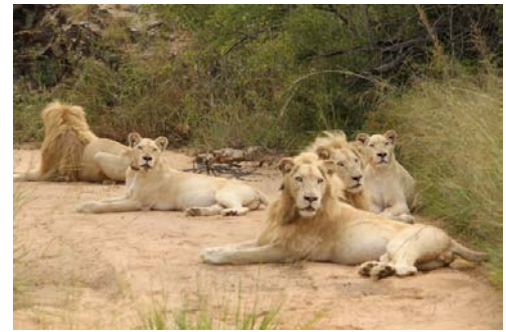
White Lions of the Royal Pride