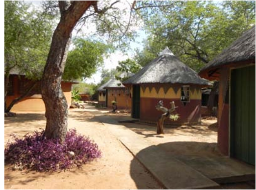
Tsau (Camp Unicorn)

Evening Tracking and Monitoring of the White Lions