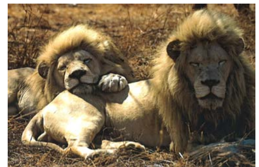
White Lions of the Akeru Pride